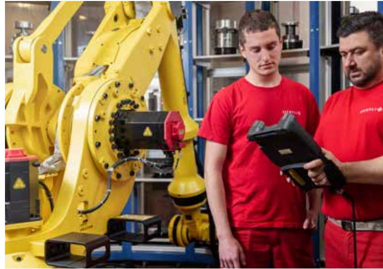
State-of-the-art production facilities and trained experts guarantee the high precision and quality of the tools.

We see ourselves as a comprehensive partner for professional woodworking. Individual tool solutions for our customers' production environments are our strength. In addition, we also offer a proven standard range of tools for a wide variety of woodworking applications. On request, we accompany with services such as engineering, application consulting, documentation, training as well as complete project support.