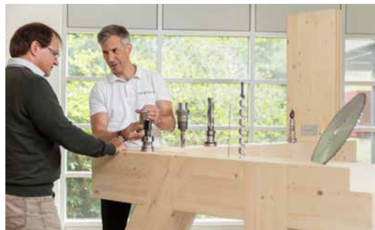
Trained professionals are available for advice in all markets.